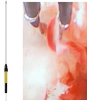
Figure 2. Illustration depicting the use of instrumentation during an intraventricular procedure within the cerebrospinal fluid in a patient with hydrocephalus, aimed at coagulating the choroid plexus (observe the use of the forceps PB SafeBlend 450 to coagulate the vessel between the pinching movement). The tip exhibits a grasping movement and is silver-coated to prevent tissue adherence during coagulation.

Artur Henrique Galvão Bruno da Cunha https://orcid.org/0000-0002-8589-8563 Marcelo Moraes Valença https://orcid.org/0000-0003-0678-3782